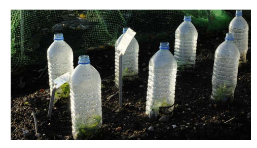
Making your own A simple cloche made from a 2lt plastic bottle with the bottom cut off. This is a good use of a waste product and also protects against slugs.