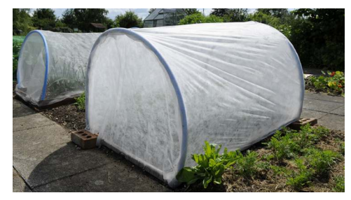
More robust, easily moveable structure.