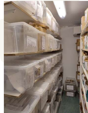
Seed Cold Store