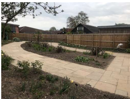
Ornamental Garden Pathway

The garden includes pond areas. Please take care whilst around open water. Your course instructor/guide will show you where the pond is during your visit.