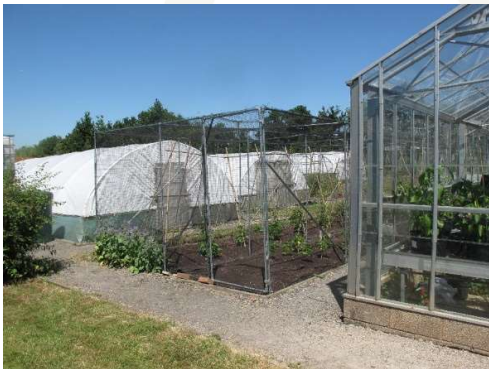
External growing spaces