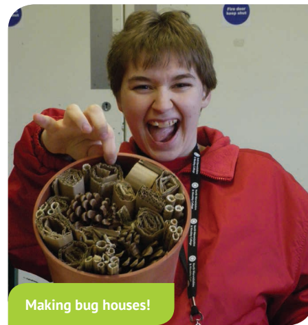
Making bug houses!

Many of the students really benefit from the increased support and supervision that an extra pair of enthusiastic hands can bring.