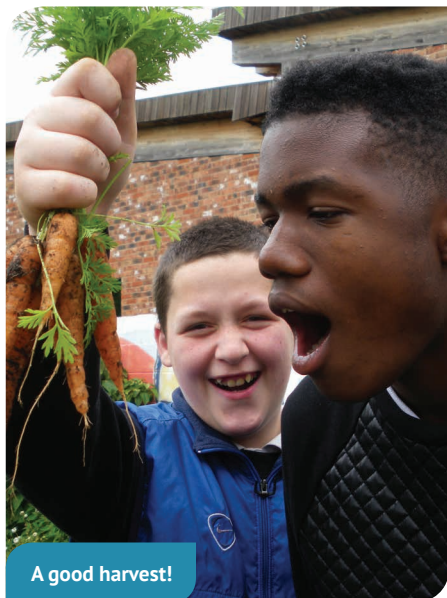
A good harvest!

Garden Organic aim for this project to be rolled out to other settings as we believe the Growing Enterprise project has the potential to benefit many different community groups.