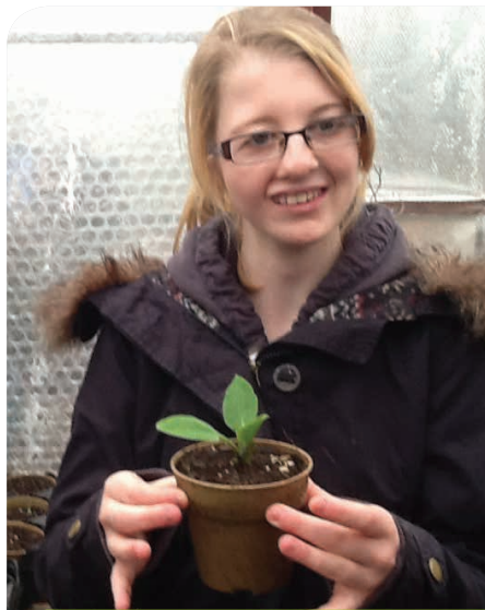
Taking root cuttings from our established 'Bocking 14' comfrey plants