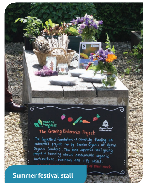
Summer festival stall

They learn employability skills by producing items for sale to the public and contribute towards managing the budget, marketing and sale of products.