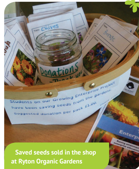
Saved seeds sold in the shop at Ryton Organic Gardens