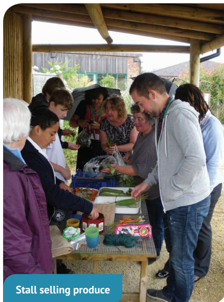
Stall selling produce