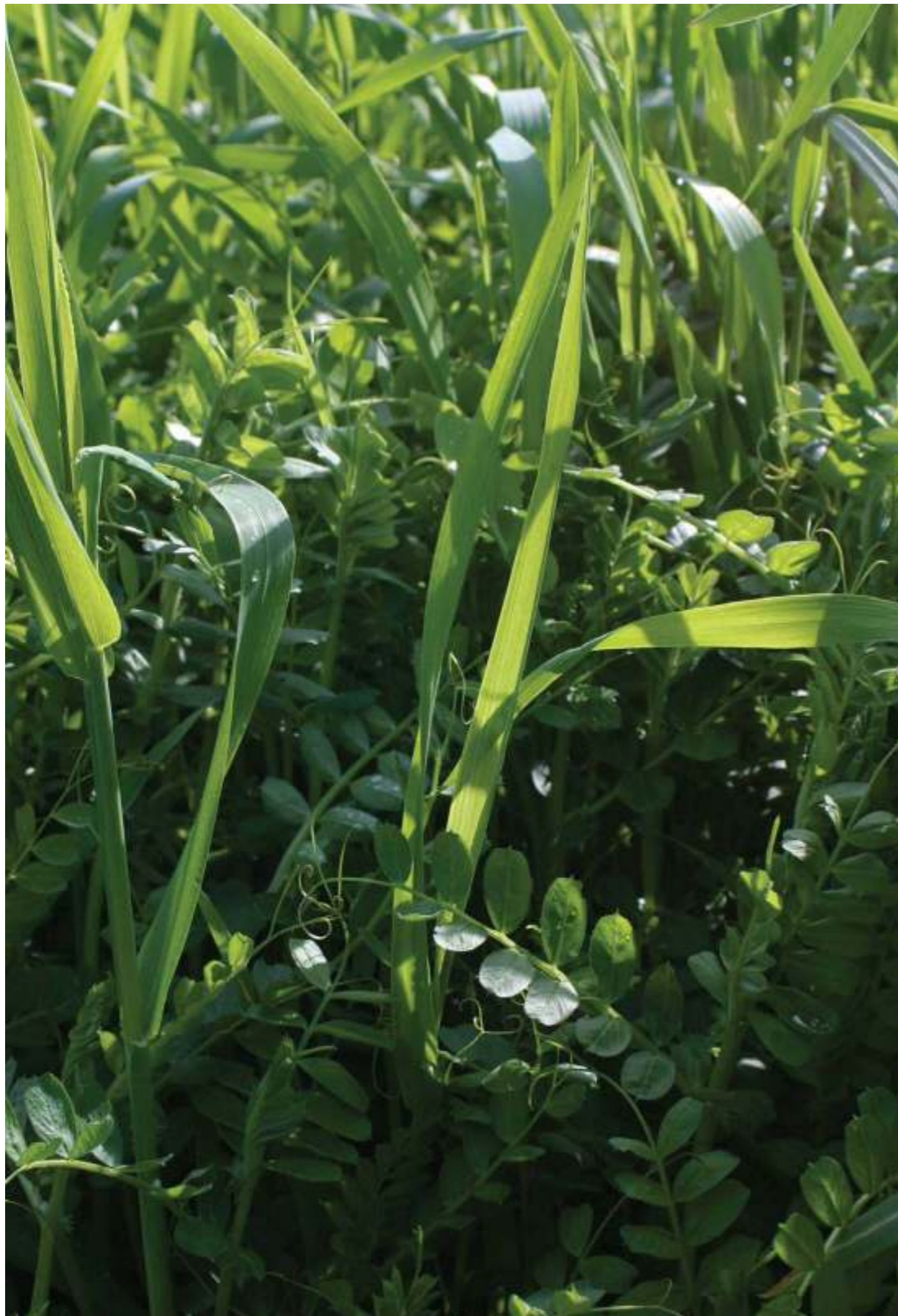
Left: Grazing rye and vetch Below: Harvesting wheat