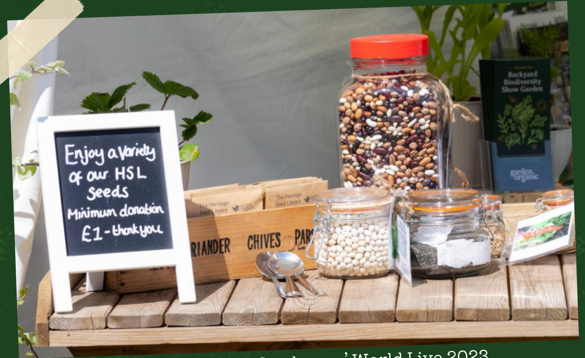
Our seed swap table at BBC Gardeners' World Live 2023