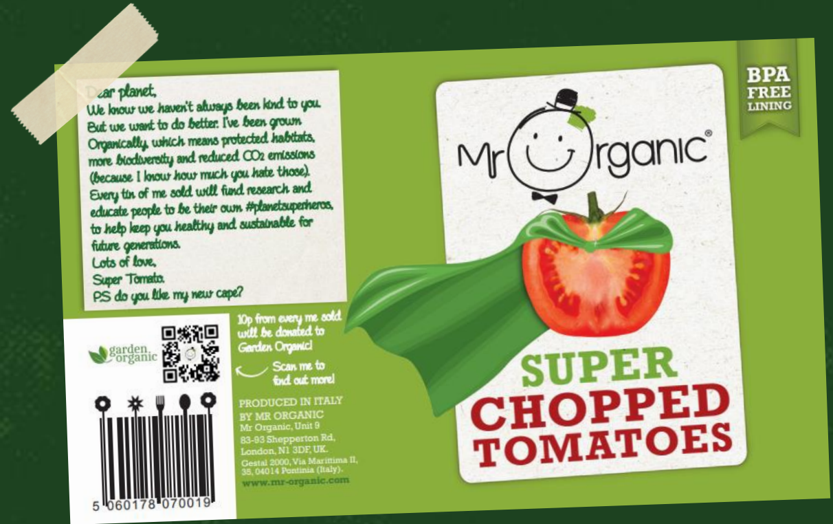
Label designs for an Organic September sales promotion

By connecting your support to a product or promotion, you're also introducing us to your audience, providing a valuable boost to help us raise awareness of who we are and what we do.