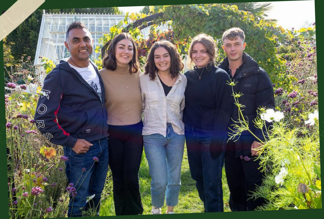
The Mr Organic team volunteering in our organic garden

To cover the costs of preparing for, and supervising a group of volunteers, we apply a small charge for volunteering days.